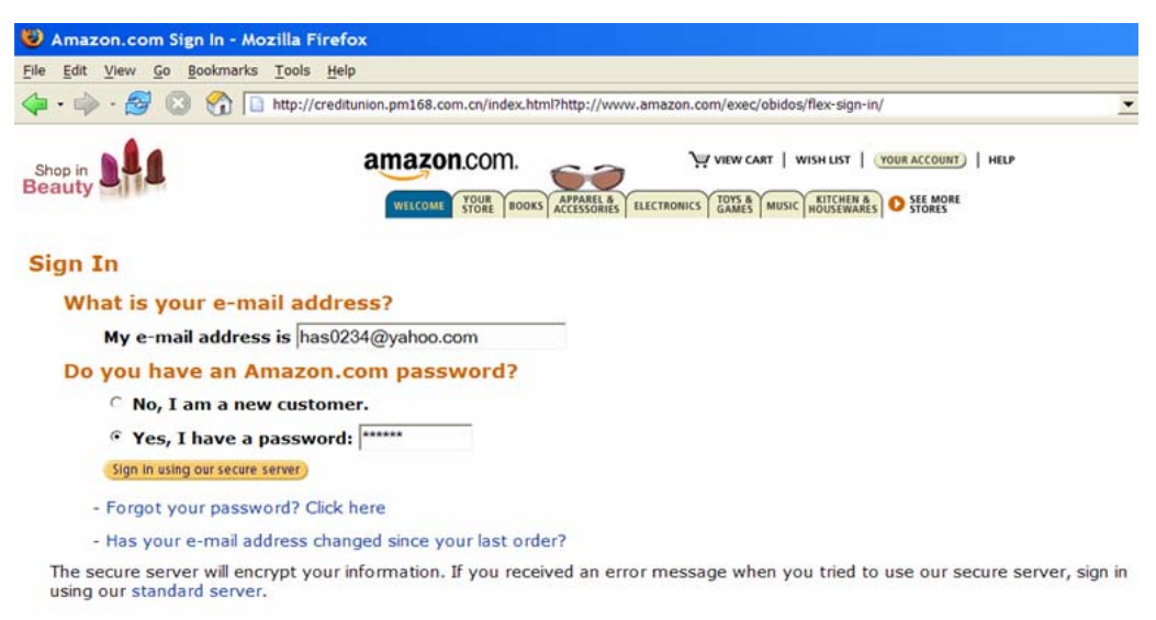
Figure 2. Sign-in page at bogus Amazon.com site, with bogus username and password.

In an effort to document the phishing attempt, the authors started a packet sniffer and followed the link provided in the e-mail despite warnings from the e-mail client. The result was a visit to a Web page that looked very much like the real Amazon.com Web site. The Uniform Resource Locator (URL) of the page -- http://creditunion.pm168.com.cn/index.html?http://www.amazon.com/exec/obidos/flex-sign-in/ -- is particularly interesting because while it clearly shows the bogus host name, creditunion.pm168.com.cn , it also shows the legitimate amazon.com login page URL. Most users will ignore the beginning of the URL once they recognize the familiar Amazon.com address and a seemingly familiar page. Of course, the question mark and everything that follows it is ignored so, in fact, the user has been redirected to the bogus host somewhere in the .cn (China) top-level domain. The authors responded to the bogus sign-in page by supplying a bogus username and password (Figure 2).